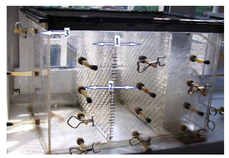
Fig. 1. The modular plexiglass installation for purification of filtrate: 1 — perforated plates for division of installation into sections; 2 — fittings for sampling of filtrate; 3 — fittings for sampling of the gas phase

The installation is made of plexiglass providing continuous visual inspection of the process dynamics. The installation is divided by two perforated plates (1) into three sections. On the one hand, they allowed separating the stages of purification, and, on the other hand, they did not interfere with mass transfer in the installation. Fittings for the sampling of the culture fluid (2) and the gas phase (3) are installed in the walls of the installation.