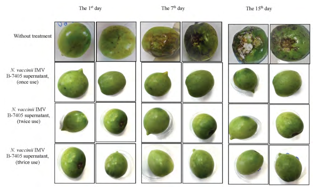
Fig. 2. The influence of different treatment methods on the storage of tomatoes

Notes: * — P < 0.05 — regarding control (number of bacterial cells on the surface washed with water pepper); ** — P < 0.05 — regarding control (number of bacterial cells on the surface of water-washed tomatoes); # — P < 0.05 — regarding control (the number of fungal cells on the surface washed with water pepper); ## — P < 0.05 — regarding control (number of fungal cells on the surface of water-washed tomatoes); the surfactant concentration in the supernatant is 0.5 g/l.