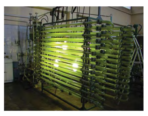
Fig. 2. Experimental tubular photobioreactor of biotechnological complex of the Institute of Hydrobiology of the National Academy of Sciences of Ukraine